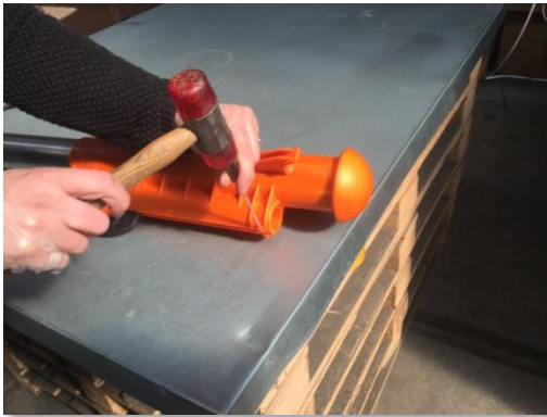
1. Remove the orange plastic security pin