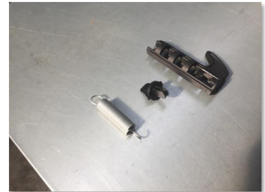
4. Prepare the new parts of the hook-system