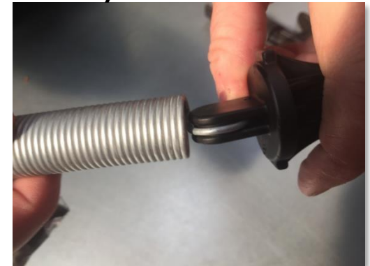
5. Assemble the spring and the black plastic cap