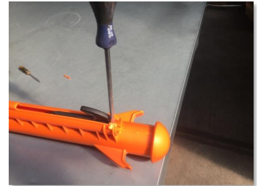
2. Enlarge the space between black hook and orange part