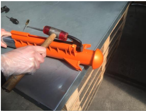
3. Remove the black plastic hook-system incl. inside parts